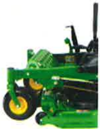
Z925M side view shown

Base Equipment On: Z915E, Z920M, Z925M, Z930M, Z930M EFI, Z950M, Z960M, Z930R, Z950R, Z970R