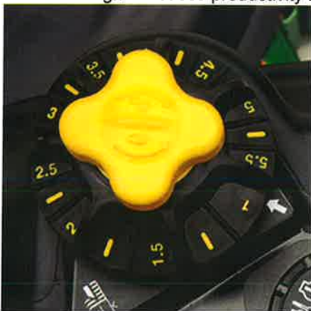
Mower deck height adjustment knob

This design increases productivity by allowing the change of cutting length without leaving the seat.