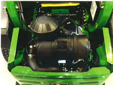
Engine air cleaner

Quote ID :14576531 Customer Name : TOWN OF YORKTOWN YORKTOWN TOWN COURT