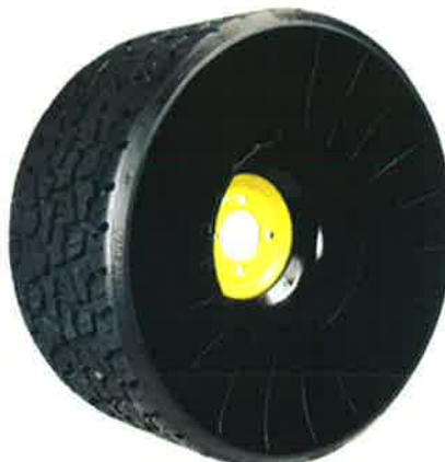
Michelin X Tweel Turf