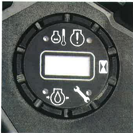
Hour meter (M Series pictured)

Use of the hourmeter and service interval chart helps determine when the machine will need service.