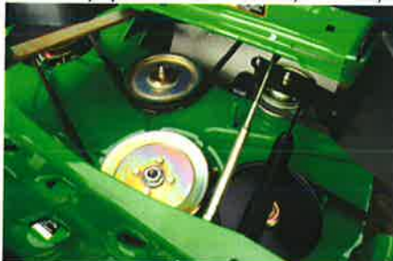
Flip-up foot panel

Base Equipment On: Z915E, Z920M, Z925M, Z930M, Z930M EFI, Z950M, Z960M, Z930R, Z950R, Z970R