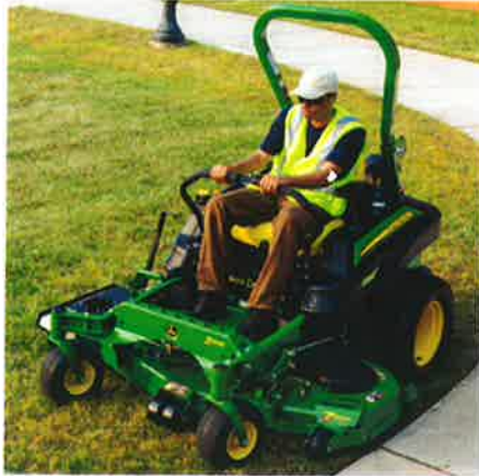
Z950M ZTrak Mower

Mowers decks are evaluated by the manufacturer (John Deere Turf Care) and conform to ANSI B71.4 2004 safety certification specifications for commercial turf care equipment.