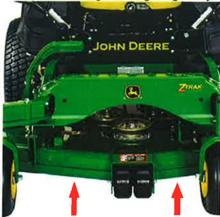
Mower rectangular leading-edge reinforcement