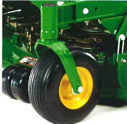
Front caster tire

Base Equipment On: Z920M, Z925M, Z930M, Z930M EFI, Z950M, Z960M