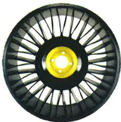
Michelin X Tweel Turf

Quote ID :14576531Customer Name : TOWN OF YORKTOWN YORKTOWN TOWN COURT