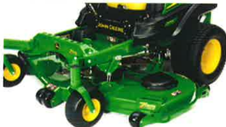
72-in. (183-cm) 7-Iron PRO deck shown

Base Equipment On: Z920M, Z925M, Z930M, Z930M EFI, Z950M, Z960M, Z930R, Z950R, Z970R