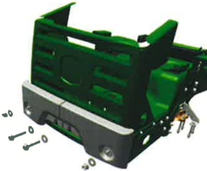
Illustration of ZTrak™ rear bumper

A steel rear bumper provides protection for the machine. The bumper is made of two pieces, making it easy to remove/install when using a material collection system (MCS).