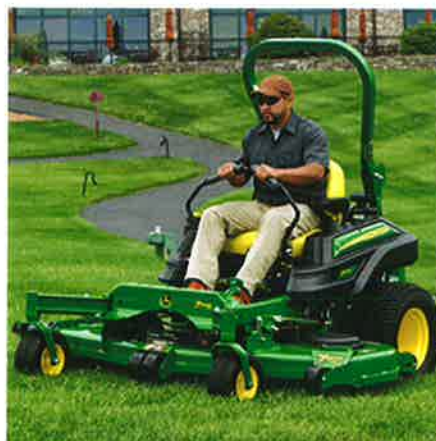
Z970R ZTrak Mower

Base Equipment On: Z915E, Z920M, Z925M, Z930M, Z930M EFI, Z950M, Z960M, Z930R, Z950R, Z970R E and M Series three-year/1200 hour bumper-to-bumper warranty