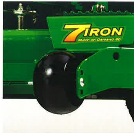
Dual-captured anti-scalp wheel

Base Equipment On: Z920M, Z925M, Z930M, Z930M EFI, Z950M, Z960M, Z930R, Z950R, Z970R 7-Iron PRO mower deck