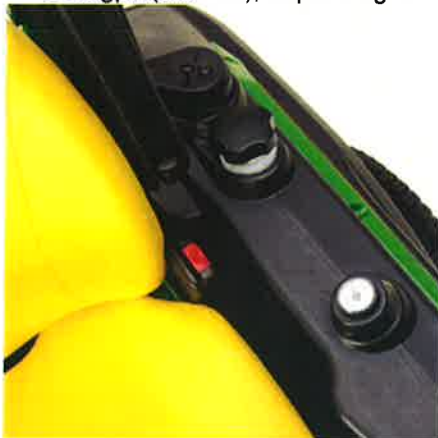
Fuel gauge and fill

Under normal conditions, load, and operation, fuel consumption for the Z900 ZTrak Mowers is 1.5 U.S. gph (5.7 L/hr) to 2.2 U.S. gph (8.3 L/hr), depending on the horsepower and conditions.