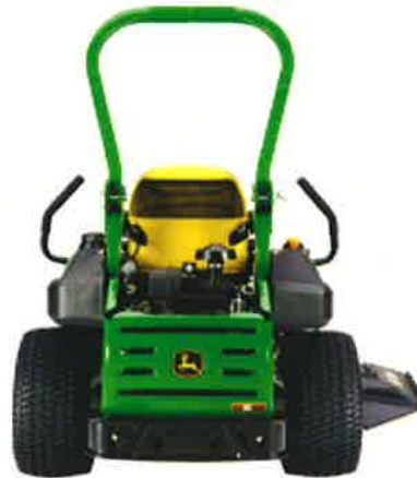
Z925M rear view shown