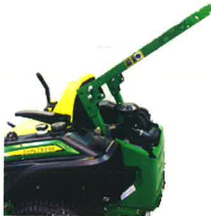
ROPS mid position