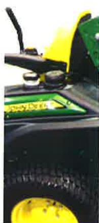
ROPS down position

Base Equipment On: Z915E, Z920M, Z925M, Z930M, Z930M EFI, Z950M, Z960M, Z930R, Z950R, Z970R