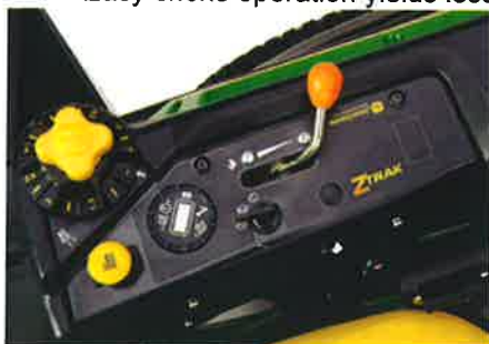
Right hand control panel

Base Equipment On: Z915E, Z920M, Z925M, Z930M EFI, Z950M, Z960M, Z930R, Z950R, Z970R