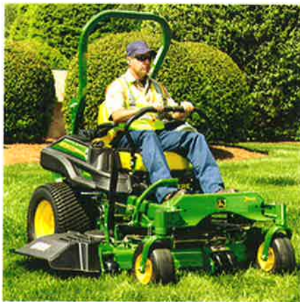
Z930M ZTrak Mower