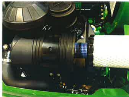
Air cleaner cover removed

Base Equipment On: Z915E, Z920M, Z925M, Z930M, Z930M EFI, Z950M, Z960M, Z930R, Z950R, Z970R