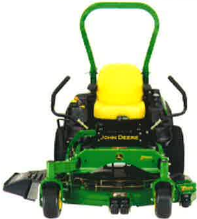
Z925M front view shown